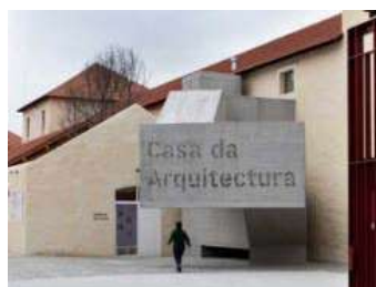
Casa da Arquitectura