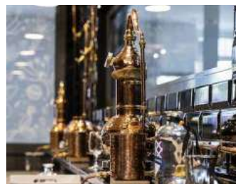
Urban Distillery & Gin School

(except watches) Avenida da Boavista, 1471