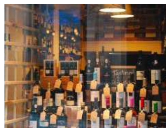
Touriga Vinhos de Portugal