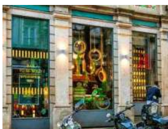
HD Bar To Be Wild

on port wine and gin Praça D. Filipa de Lencastre, 1