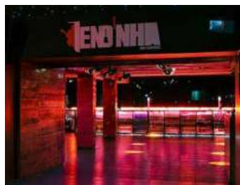
Tendinha dos Clérigos