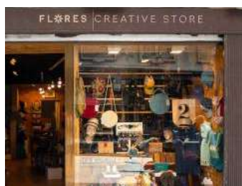
Flores Creative Concept Store

Avenida Menéres, 456 4450-189 Matosinhos