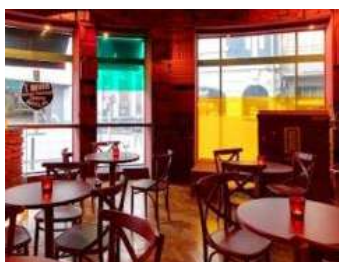
Fé Wine & Club