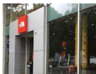
The North Face Porto